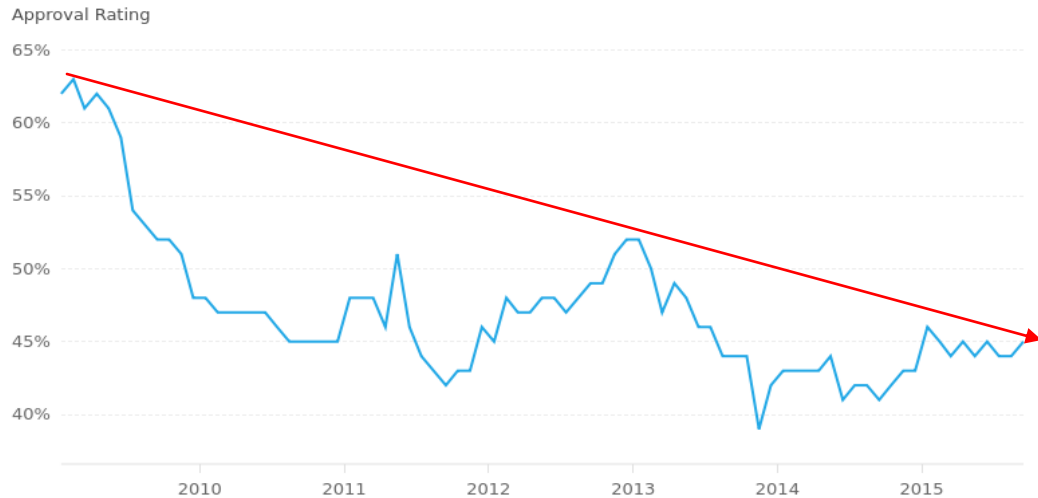
Barack Obama - Presidential Approval Ratings